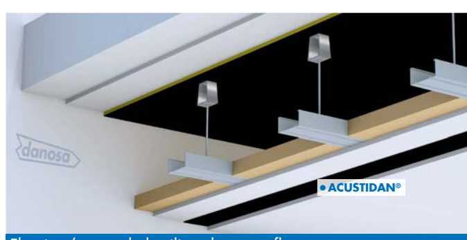
Floating/suspended ceilings between floors.